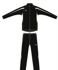
Puma - V-Kon Tracksuit Graphite