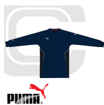
Puma - V-Kon Sweater - Navy