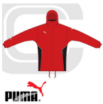
Puma - Junior V-Kon Shell Jacket Red