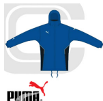
Puma - V-Kon Shell Jacket - Royal