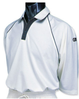
Junior Club Premier Plus Shirt Bottle