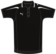
Club Polo Shirt Black