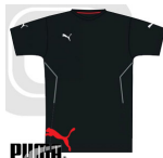
Puma V-Kon T-Shirt - Graphite