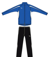
Puma - Junior V-Kon Tracksuit Royal