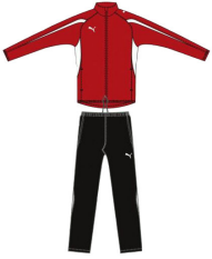
Puma - Junior V-Kon Tracksuit Red