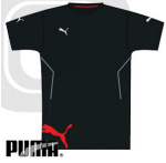
Puma Junior V-Kon T-Shirt - Graphite