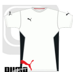
Puma Junior V-Kon T-Shirt - White