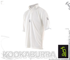
KB Active Shirt