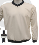
C21 Newbery Hydrotek Sweater