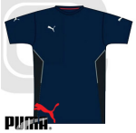
Puma Junior V-Kon T-Shirt - Navy