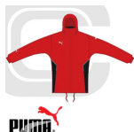
Puma - V-Kon Shell Jacket - Red