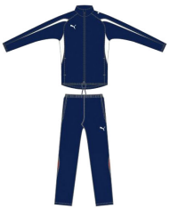
Puma - Junior V-Kon Tracksuit Navy