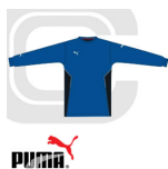
Puma - V-Kon Sweater - Royal