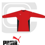
Puma - V-Kon Sweater - Red