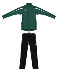
Puma - V-Kon Tracksuit Green