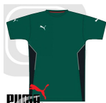
Puma V-Kon T-Shirt - Green