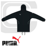
Puma - Junior V-Kon Shell Jacket Graphite