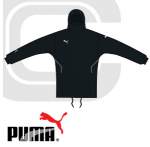
Puma - V-Kon Shell Jacket - Graphite