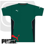
Puma Junior V-Kon T-Shirt - Green