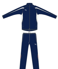
Puma - V-Kon Tracksuit Navy