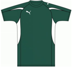
Club Polo Shirt Bottle