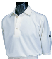
GM Premier Shirt