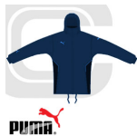
Puma - V-Kon Shell Jacket - Navy