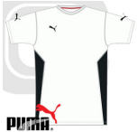
Puma V-Kon T-Shirt - White