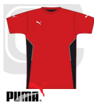
Puma V-Kon T-Shirt - Red