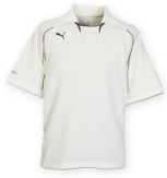
Puma Balistic Cricket Shirt