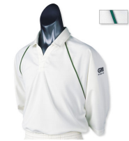
Gunn & Moore Teknik Shirt Bottle