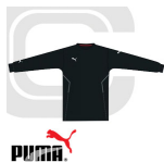
Puma - Junior V-Kon Sweater Graphite