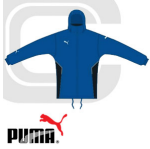
Puma - Junior V-Kon Shell Jacket Royal