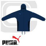
Puma - Junior V-Kon Shell Jacket Navy