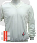
Pro Performance Sweater Plain