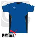
Puma V-Kon T-Shirt - Royal