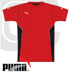
Puma Junior V-Kon T-Shirt - Red