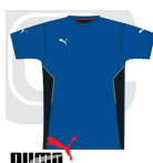
Puma Junior V-Kon T-Shirt - Royal