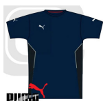
Puma V-Kon T-Shirt - Navy