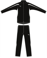
Puma - Junior V-Kon Tracksuit Graphite