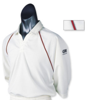
Gunn & Moore Teknik Shirt Maroon