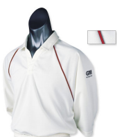
Gunn & Moore Teknik Shirt Maroon