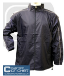
Gamegear Sporting Jacket Navy/White