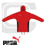
Puma - V-Kon Shell Jacket - Red