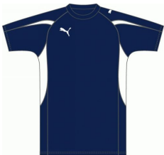
Club Polo Shirt Navy