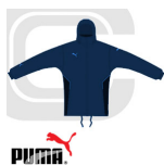
Puma - V-Kon Shell Jacket - Navy