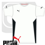
Puma Junior V-Kon T-Shirt - White