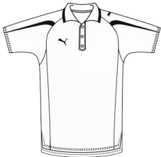
Club Polo Shirt White