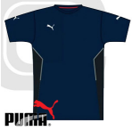
Puma Junior V-Kon T-Shirt - Navy