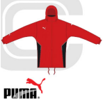
Puma - Junior V-Kon Shell Jacket Red