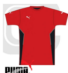
Puma Junior V-Kon T-Shirt - Red