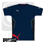
Puma V-Kon T-Shirt - Navy