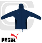
Puma - Junior V-Kon Shell Jacket Navy