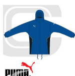
Puma - Junior V-Kon Shell Jacket Royal