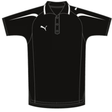
Club Polo Shirt Black