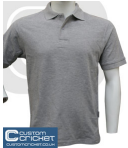
Junior Club Polo Shirt Grey