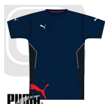
Puma Junior V-Kon T-Shirt - Navy