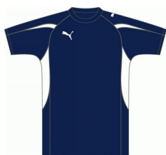
Club Polo Shirt Navy