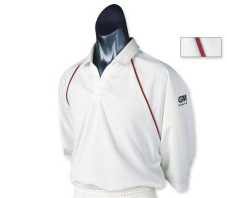
Gunn & Moore Teknik Shirt Maroon