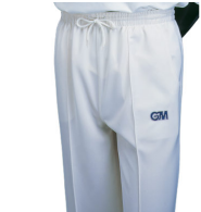
Gunn & Moore Premier Trousers