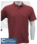
Junior Club Polo Shirt Burgundy