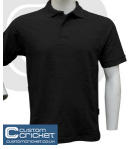
Junior Club Polo Shirt Black