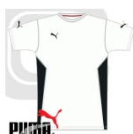
Puma Junior V-Kon T-Shirt - White