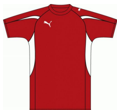
Club Polo Shirt Burgundy