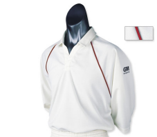
Gunn & Moore Teknik Shirt Maroon