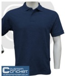
Junior Club Polo Shirt Navy