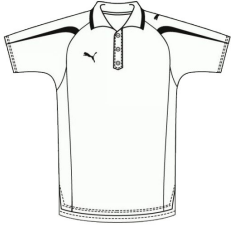
Club Polo Shirt White