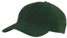
Club Cap Bottle